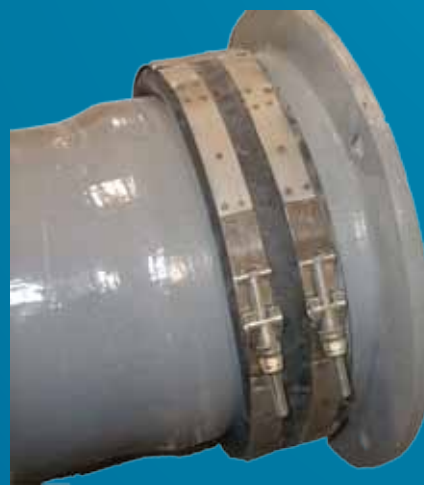
FLANGED ENDS FOR BOLTING TO WALL

The Plasti-Fab Composite Scum Skimmer offers an alternative to metal scum skimmers that need routine maintenance to prevent freezing in place. The Composite Scum Skimmer is non-metallic, preventing any binding or bimetallic corrosion.